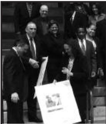
Citizens Bank officials with MHA staff and Board at Maplewood Court

On Thursday, April 12, MHA staff, residents and board members celebrated with Citizens Bank officials as MHA was recognized as a Champion in Action. The Champions in Action Program is a partnership between Citizens Bank and News Channel 8/MyTV9 launched in 2002 to provide financial support and public awareness to