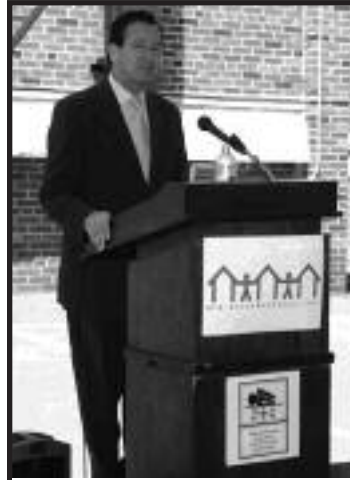
Stamford Mayor Dan Malloy greets guests

On June 1, MHA and New Neighborhoods Inc. celebrated the beginning of the renovation of Friendship House on Perry Street in Stamford. The 121 unit building will be renovated throughout, with all units receiving new kitchens and bathrooms, and making the building more accessible for persons with disabilities. The wonderful celebration took place under a large tent in the parking